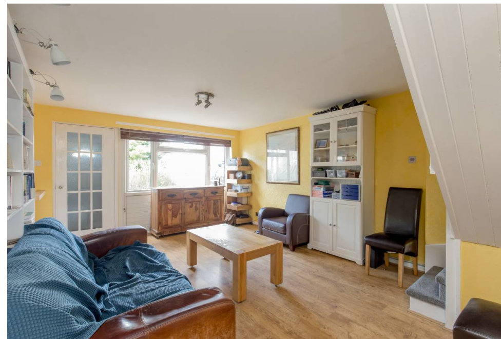
Baberton Mains Lea, EH14 3HB

Recreational facilities include Baberton and Kingsknowe golf clubs, use of the sports facilities at the Wester Hailes Education Centre, walk along the Water of Leith Walkway and in the Pentland Country Park.