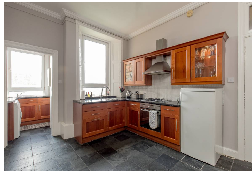
Ashely Terrace, EH11 1RT

Viewing on Sunday 2-4pm or by appointment phone 0131 337 1800