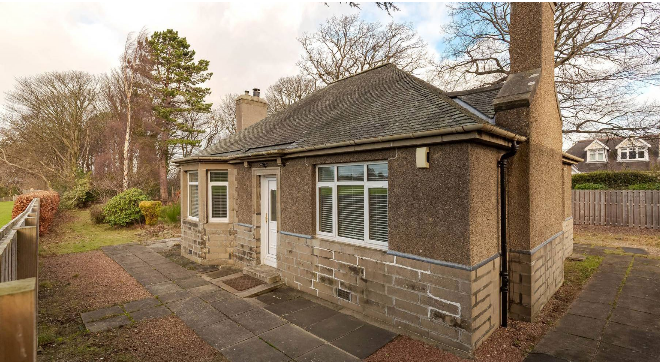
East Lodge, 27 Paties Road Colinton, Edinburgh, EH14 1EG