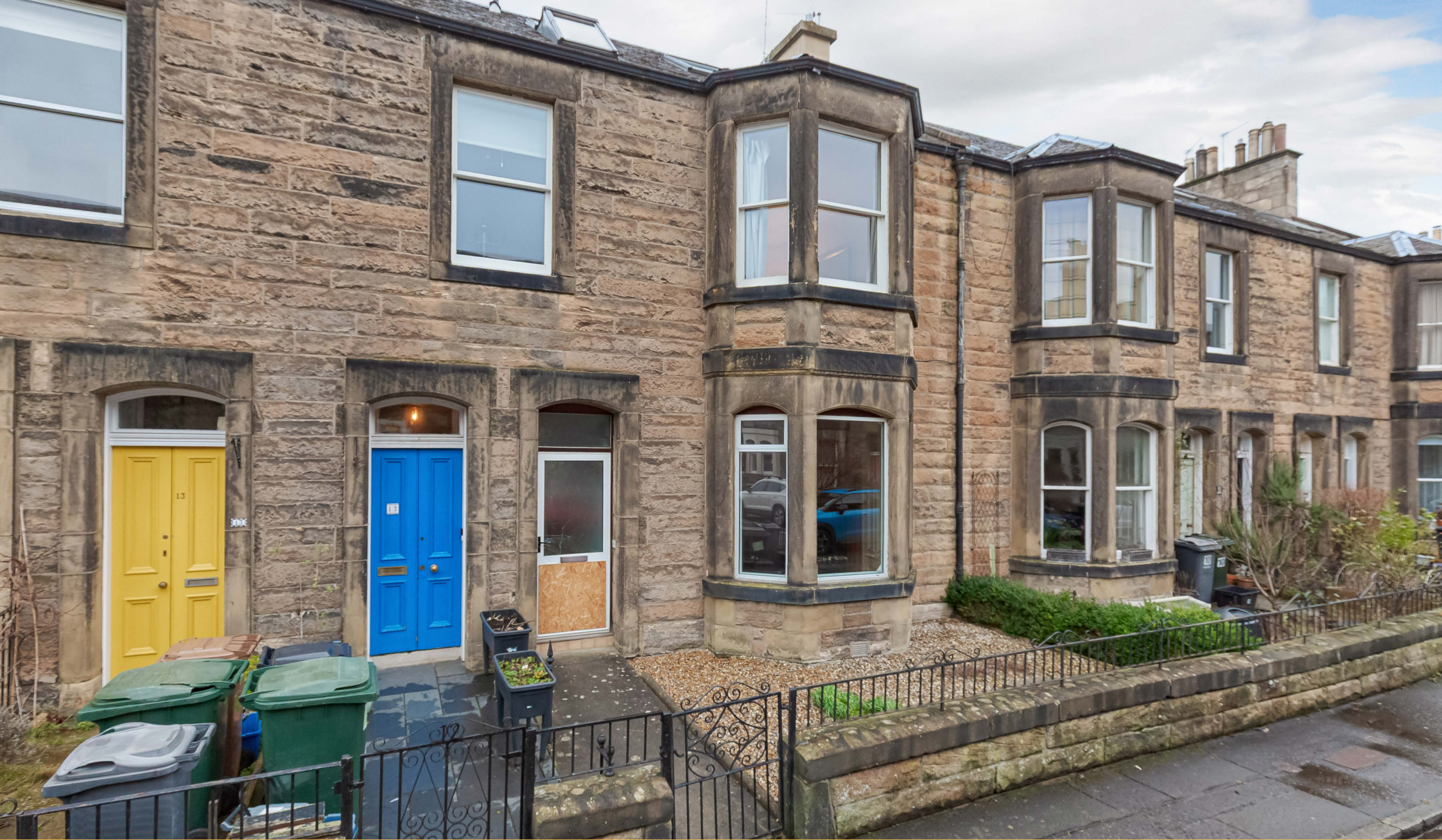
11 Almondbank Terrace, Shandon, Edinburgh, EH11 1SR Spacious one-bedroom lower villa with front and rear gardens