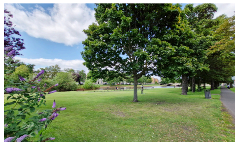
RIVER ESK OPPOSITE FLAT