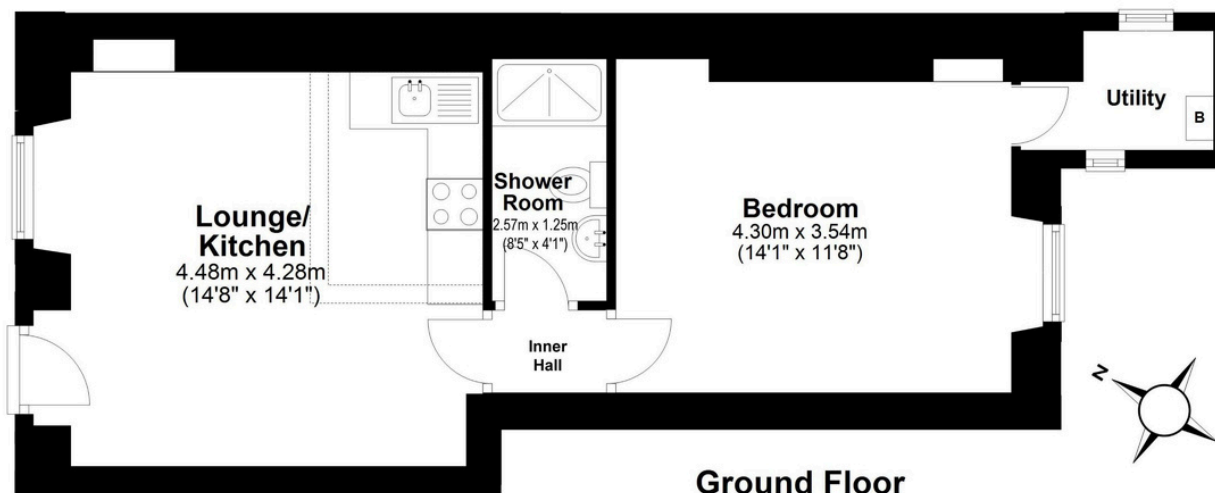
Ground Floor Approx. 43.9 sq. metres (472.9 sq. feet)

Interested parties are advised to note interest through a solicitor, so that they are notified of any closing date, and on whose behalf their solicitor may request a copy of the seller's home report. These particulars do not form part of any contract and the statements or plans contained herein are not warranted nor to scale. Approximate measurements have been taken by electronic device at the widest point. Services and appliances have not been tested for efficiency or safety and no warranty is given as to their compliance with any regulations. Confirmation of Council tax bands can be obtained from the local Council websites. Where the property has been altered or extended in any way by the sellers or previous owners, we are not always in a position to verify, prior to preparation of the schedule of particulars, that all necessary Local Authority consents are available.