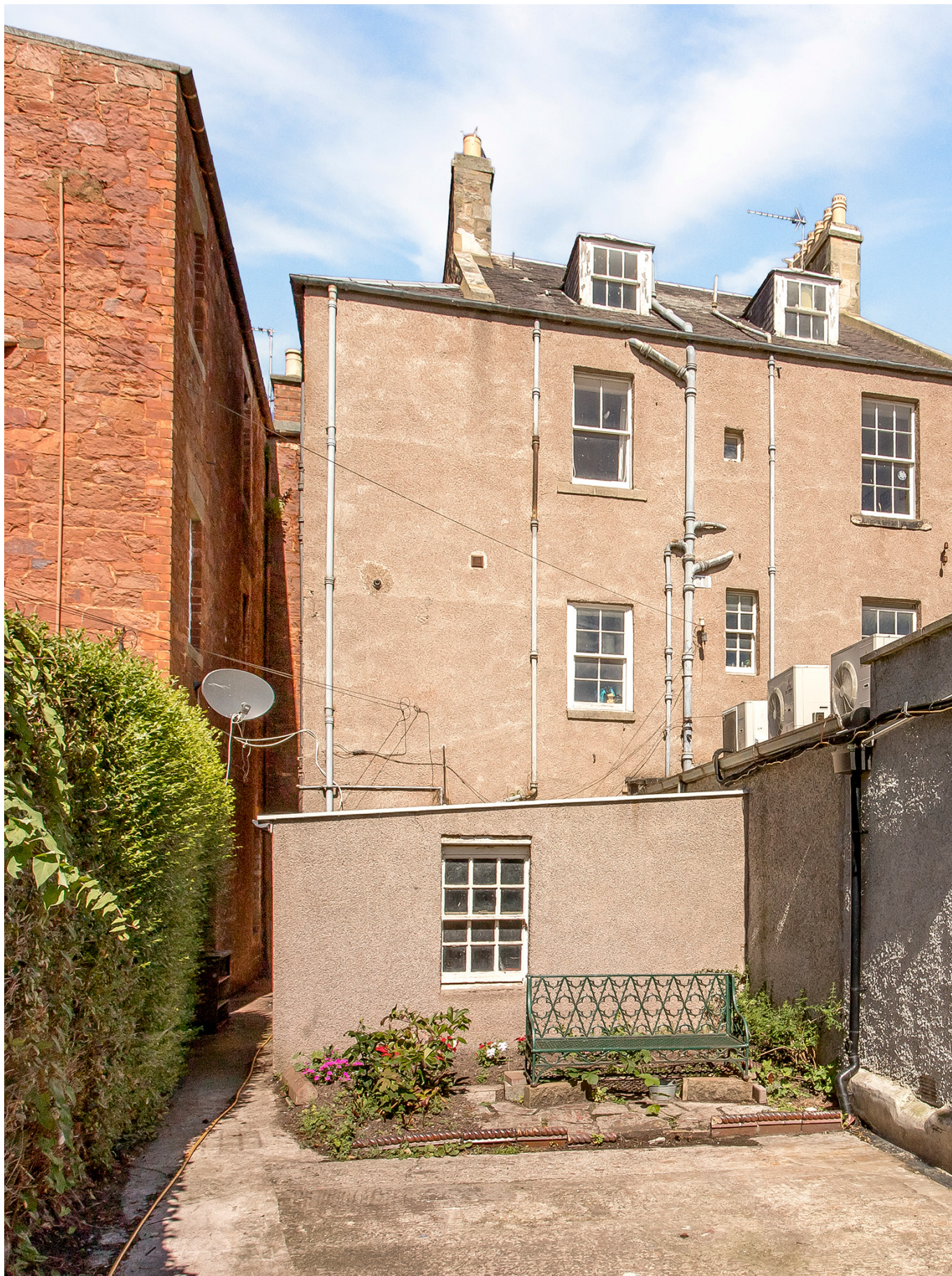
Outside, there is a low-maintenance shared garden to the rear.