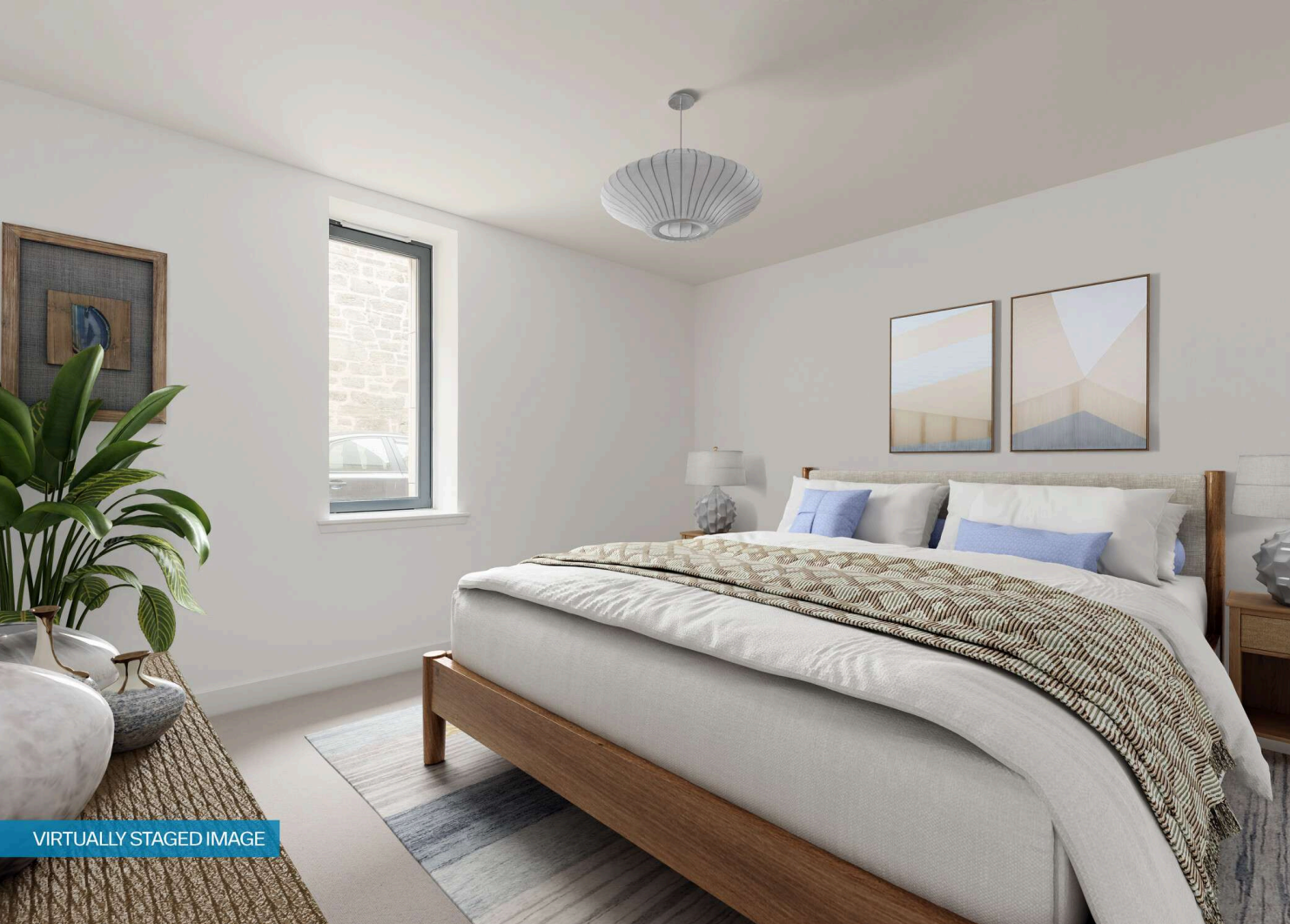
VIRTUALLY STAGED IMAGE