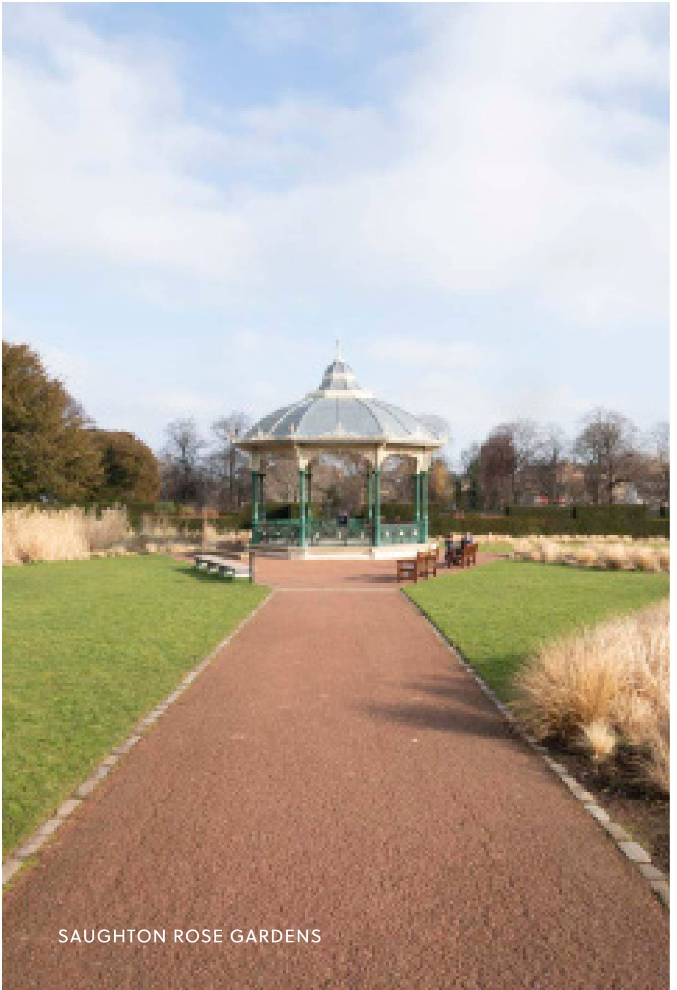
SAUGHTON ROSE GARDENS