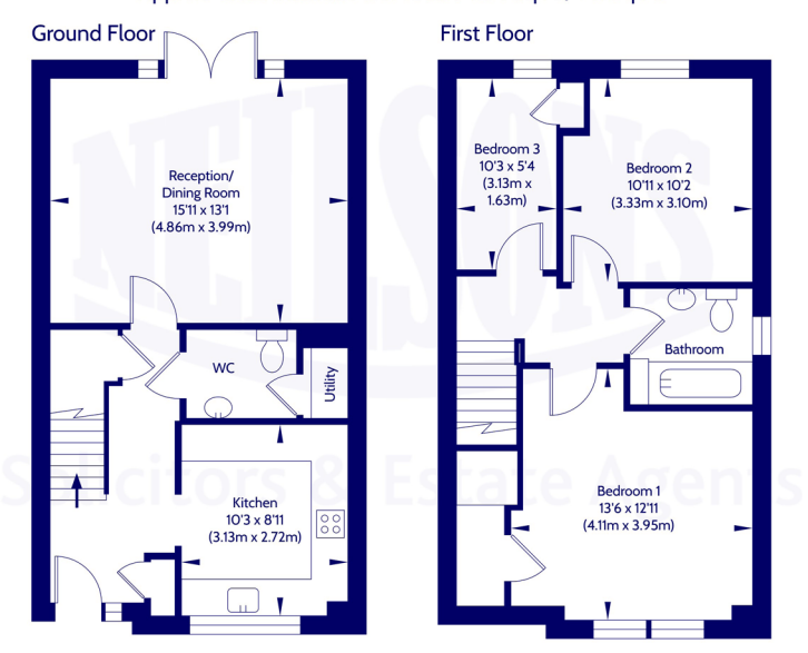
Area excludes garages, outbuildings, attics and eaves if applicable. All measurements are approximate. Not to scale. For identification only. © 2024 Neilsons Solicitors & Estate Agents. Plans by Planography.co.uk

Whilst we endeavour to ensure that our sales particulars are accurate and reliable, the following general points should be noted with regard to the extent of our investigations prior to marketing the property and therefore if any particular aspect is of crucial relevance to you, please contact this office for verification particularly if you are contemplating travelling some distance to view.