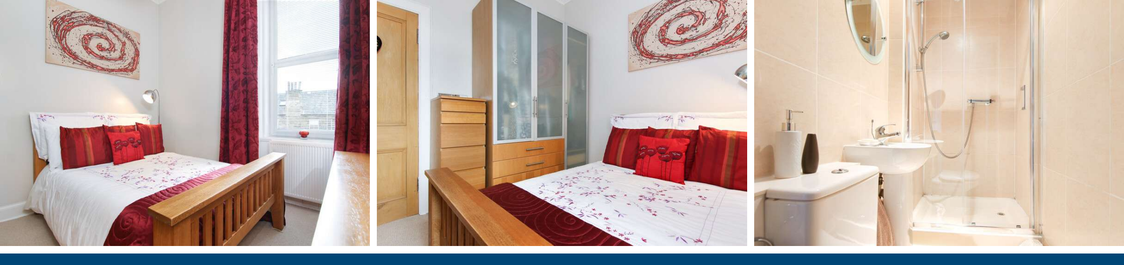
31/3 Ashley Terrace lies in the Shandon district of Edinburgh and is perfect for professionals and families alike, thanks to it's location and versatile accommodation.

Approached off a well-kept stair with secure entryphone system, the front door of this first/top floor property opens into a welcoming hallway. The sitting room is flooded with light from twin windows (with wooden surrounds) and features a handsome fireplace, ceiling cornicing and rose, and an Edinburgh press. The room allows for various configurations and could be utilised as a bedroom, turning the dining room into a sitting room. The dining room, also with an Edinburgh press and with a good sized storage cupboard, leads to the galley kitchen, which is fitted with modern Shaker-style wall and base cabinets, along with a range of appliances. Returning to the hall, there are two double bedrooms, a shower room, family bathroom (with overhead shower) and an access hatch with Ramsay ladder to a large, partially floored loft providing excellent storage and the potential to extend the property.