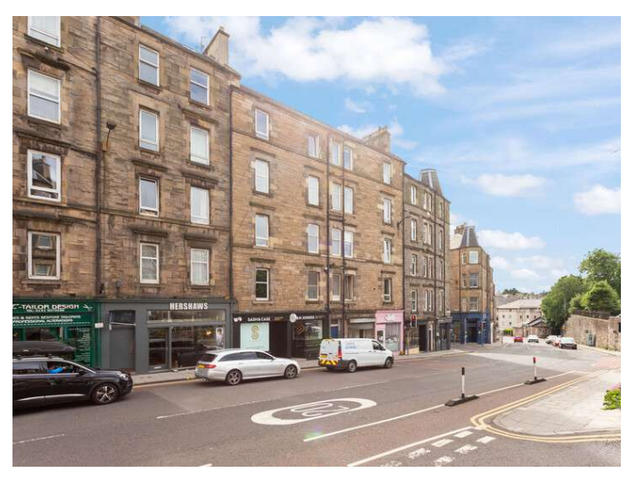
11 (1F3) Rodney Street, Edinburgh, EH7 4EN