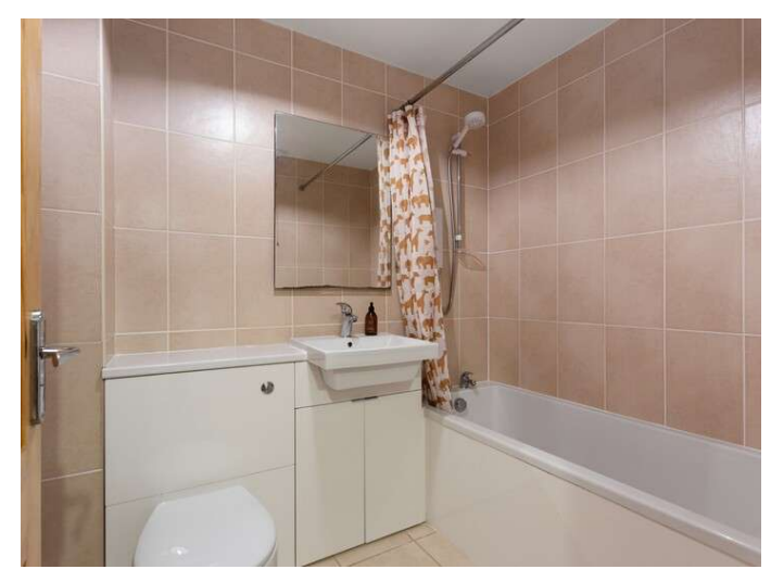
18/1 Windsor Place, Portobello, EH15 2AA