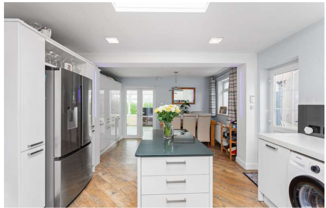
29 Drum Brae South, Corstorphine, Edinburgh, EH12 8DT