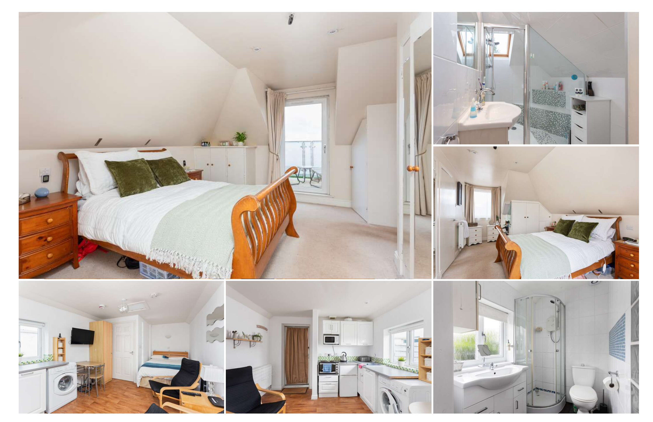
29 Drum Brae South, Corstorphine, Edinburgh, EH12 8DT