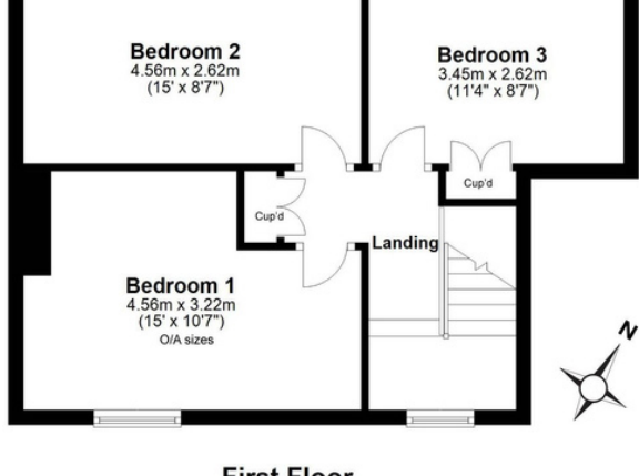
First Floor Approx. 43.3 sq. metres (466.4 sq. feet)