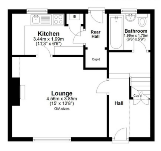
Ground Floor Approx. 39.5 sq. metres (425.4 sq. feet)

Total Area: approx. 82.9 sq.metres (891.8 sq. feet)