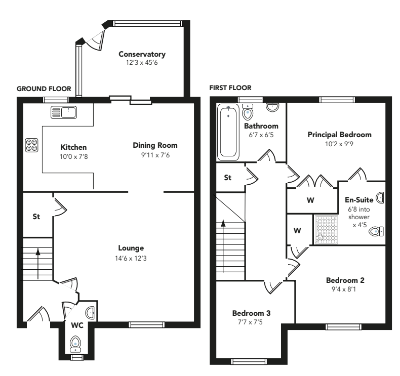
Floorplans are indicative only - not to scale Produced by Plushplans A

Whilst we endeavour to make these particulars as accurate as possible, they do not form part of any contract of offer, nor are they guaranteed. Measurements are approximate and in most cases are taken with a digital/ sonic-measuring device and are taken to the widest point. We have not tested the electricity, gas or water services or any appliances. Photographs are reproduced for general information and it must not be inferred that any item is included for sale with the property. If there is any part of this that you find misleading or simply wish clarification on any point, please contact our office immediately when we will endeavour to assist you in any way possible.