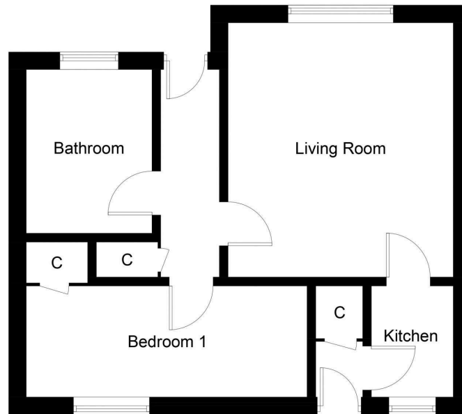
Illustration for identification purposes only, measurements are approximate, not to scale. floorplansUsketch.com © (ID1061941)