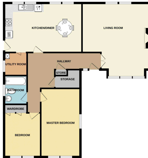
MODERN DETACHED BUNGALOW

While every effort has been made to ensure the accuracy of the floorplan (including floor measurements), it should be noted that the floor plan is an approximation and is not intended to be used as a substitute for a professional survey. The floor plan is for illustrative purposes only and should be used as such by any prospective purchaser. The architect, surveyor and specialist advisers have not been instructed to guarantee any dimensions or fixtures, fittings or finishes.