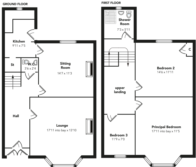
Floorplans are indicative only - not to scale Produced by Plushplans

Whilst we endeavour to make these particulars as accurate as possible, they do not form part of any contract of offer, nor are they guaranteed. Measurements are approximate and in most cases are taken with a digital/ sonic-measuring device and are taken to the widest point. We have not tested the electricity, gas or water services or any appliances. Photographs are reproduced for general information and it must not be inferred that any item is included for sale with the property. If there is any part of this that you find misleading or simply wish clarification on any point, please contact our office immediately when we will endeavour to assist you in any way possible.