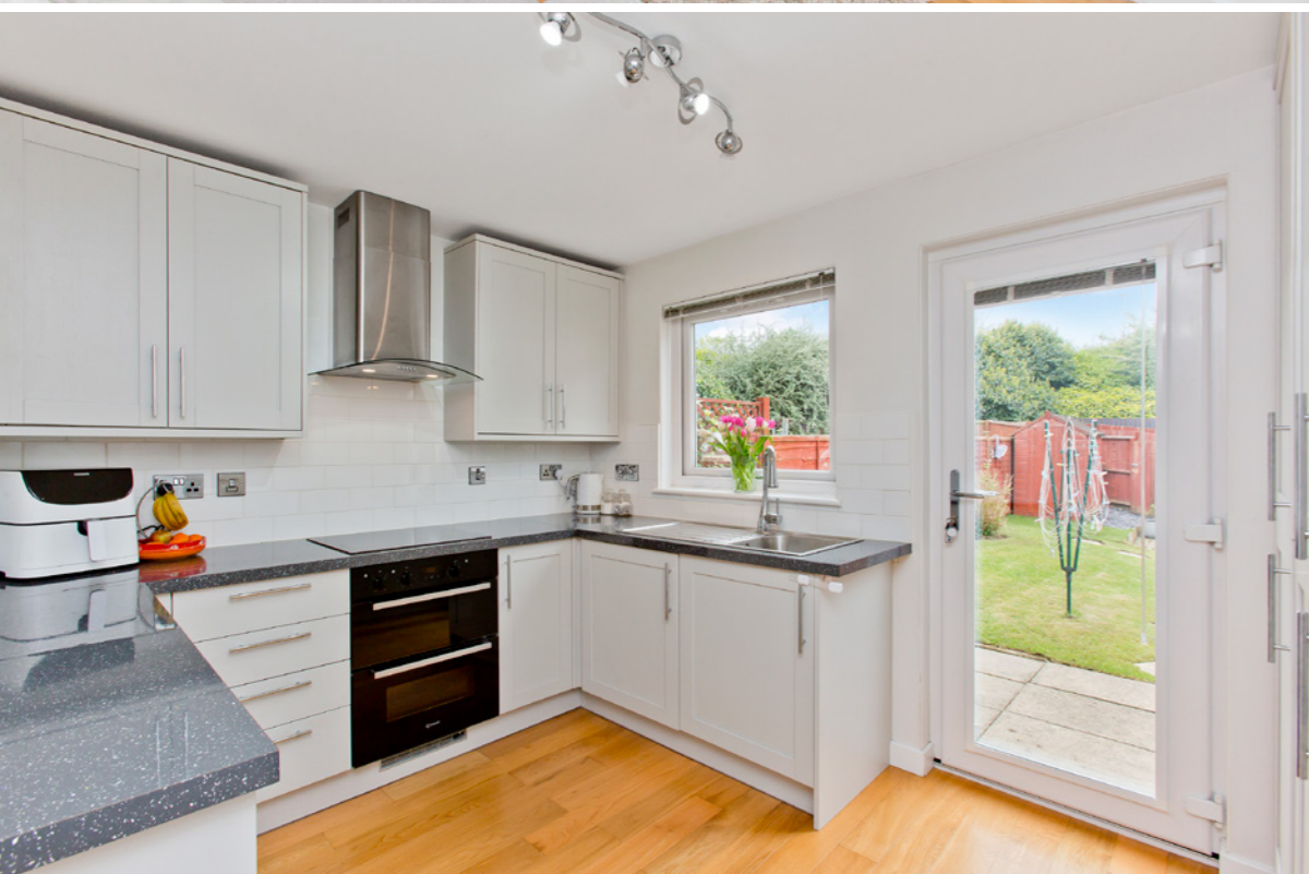
"...Mid-terraced house in South Gyle, part of a leafy, cul-de-sac development..."