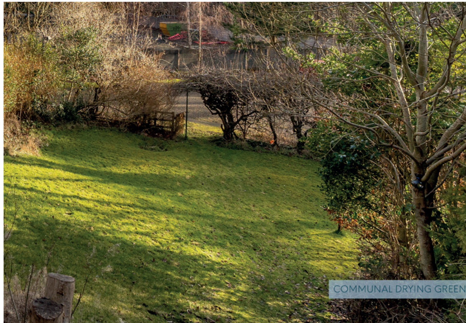
COMMUNAL DRYING GREEN