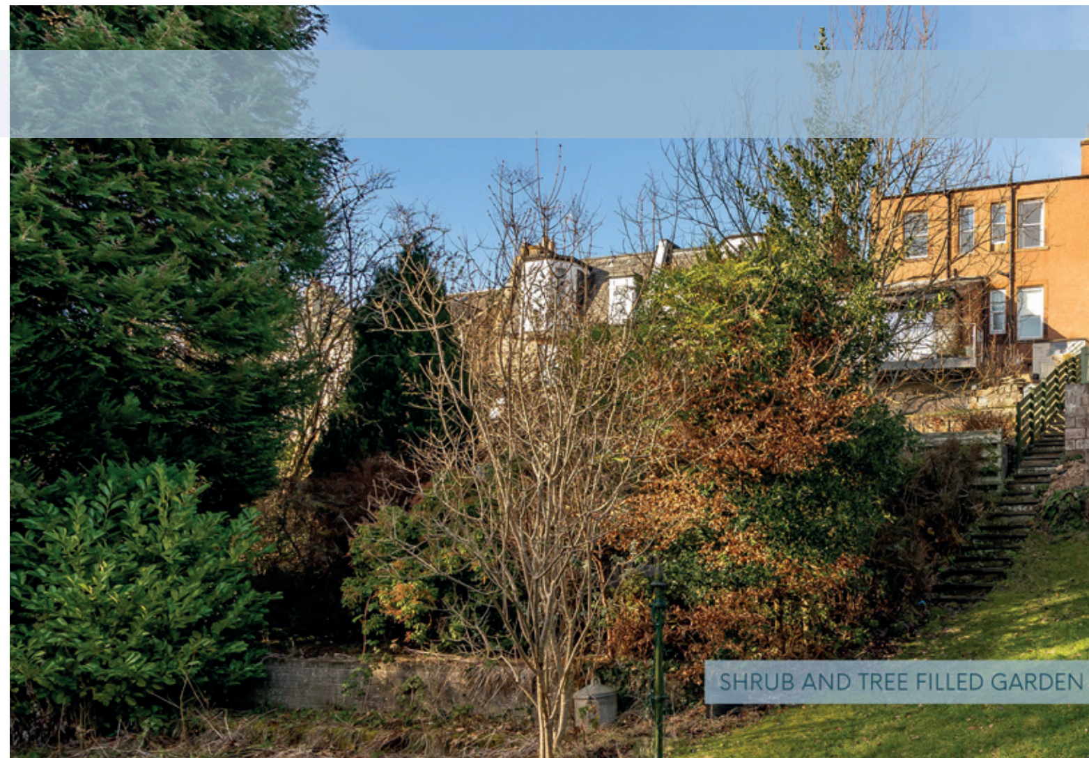
SHRUB AND TREE FILLED GARDEN